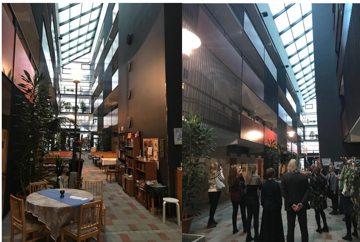
Photos: Taking a tour of the facilities of Caritaslaiset

During the lunch break, those who wished to were able to take a short tour of the care facility of Caritaslaiset where our meeting was being held. We were given an explanation of the accommodation provided there, including the sheltered living apartments and the fitness facilities, and able to meet a group of residents taking part in an activity organised by Caritaslaiset.